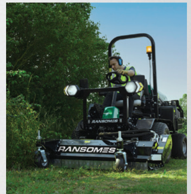
Versatile, comfortable & manoeuvrable