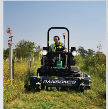
Premium Műthing® finish for grass cut less frequently