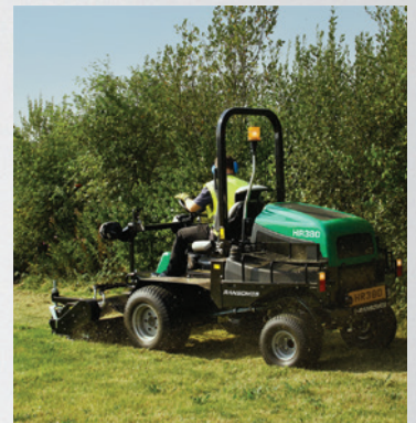
Powerful, clean, green Stage V engine